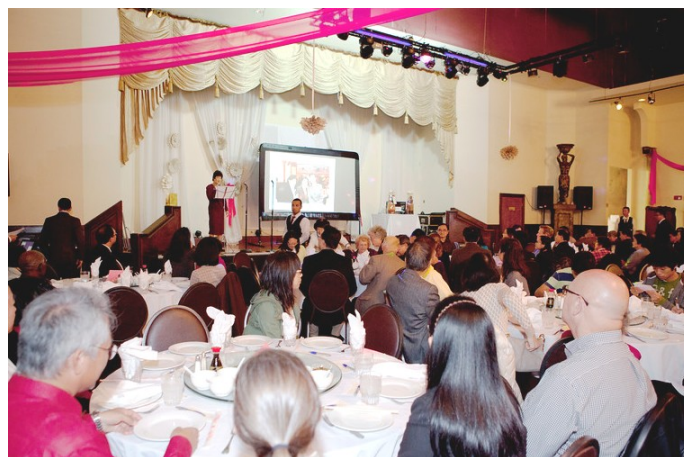
Welcoming guests to our ACCESS 10th Anniversary Celebration and Fundraising Dinner Gala