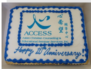
ACCESS 10th Anniversary Celebration cake